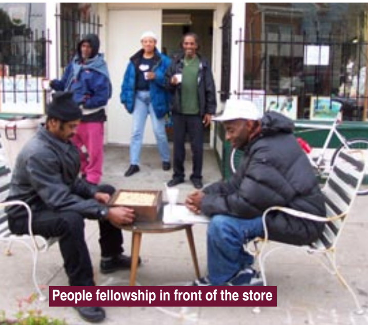
People fellowship in front of the store

What started as a men’s Bible study, now draws 150 people every Saturday. For many, it is their church. Everyone attends, from the church lady to the prostitute. Many come not because they are hungry, but because they enjoy the presence of the Lord.