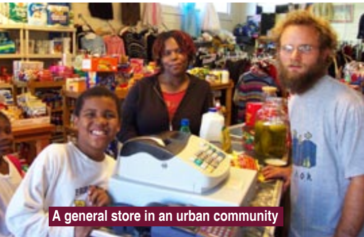
A general store in an urban community

Across the street is an elementary school and a liquor store, where children used to buy candy. Our store now draws 90% of the children’s candy business. One lady came in for cigarettes (which we do not sell). A six-year-old explained, “This is God’s store.”