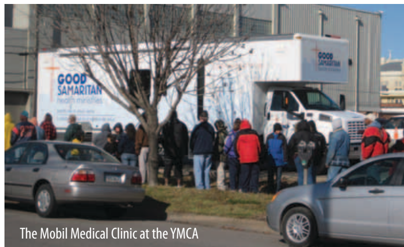
The Mobil Medical Clinic at the YMCA