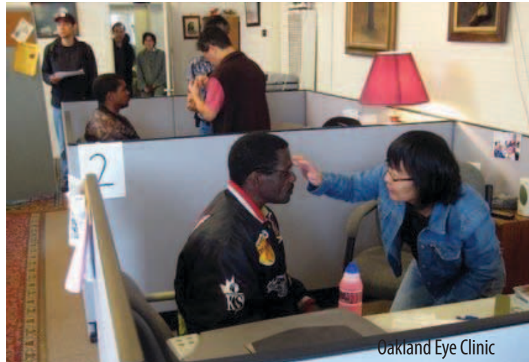
Oakland Eye Clinic