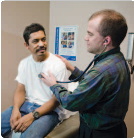
Good Samaritan Clinic