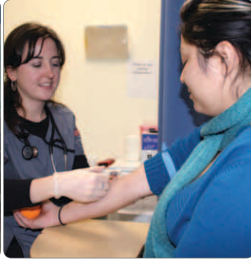
Watts Christian Health Center