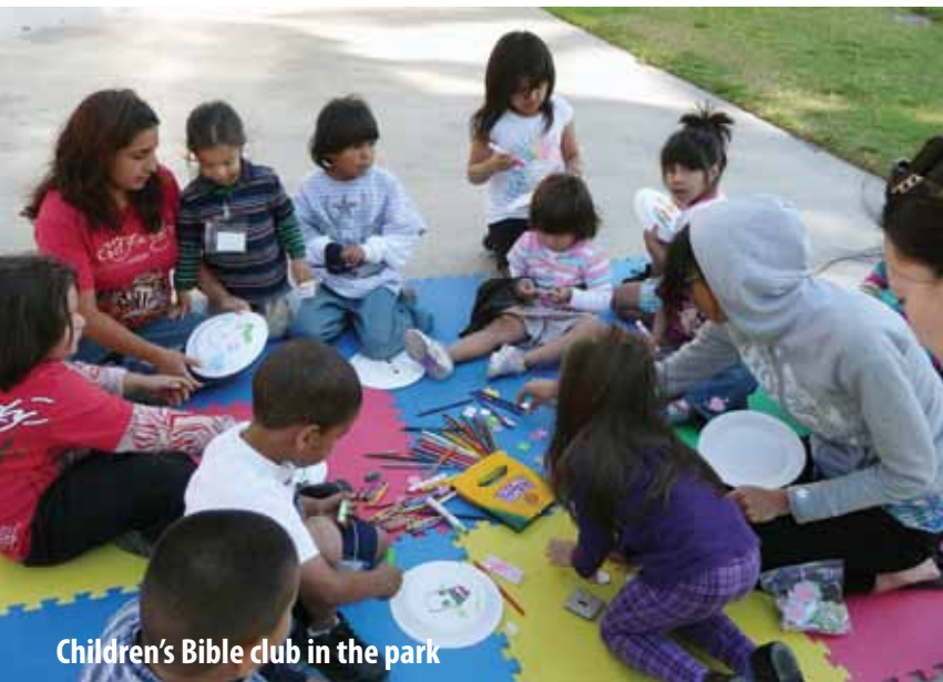
Children's Bible club in the park